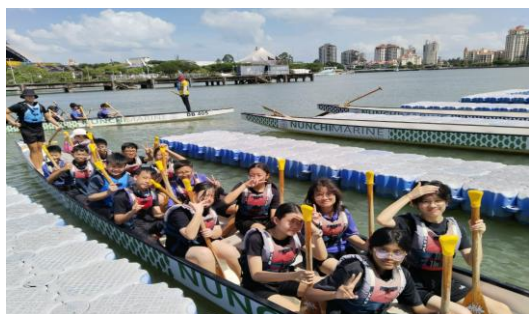
Sec 1 StaRs going for dragonboating

2. StaRs Programme. Our students have successfully completed the school's iconic cohort-level student development experience from 27 Feb to 1 Mar. Ranging from outdoor activities, Applied Learning Modules @ Schools, interview skills and learning journeys, the four-day programme has honed our students' social and emotional competencies and enabled them to grow holistically.