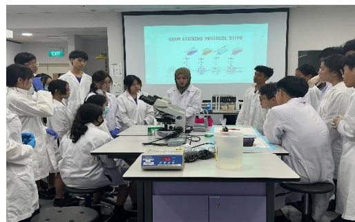
Sec 4 & 5 StaRs visiting Institutions of Higher Learning (IHLs)