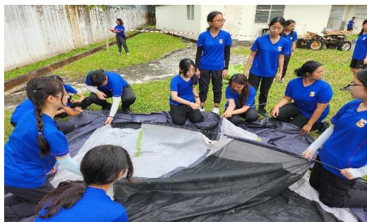
Sec 3 StaRs learning how to pitch a tent