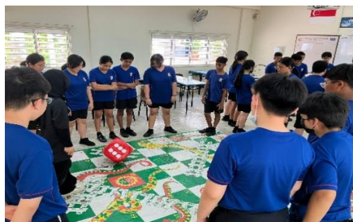
Sec 2 StaRs in a giant game of Snake & Ladders