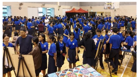
Sec 2 StaRs showcasing their learning from various ApLM @ Schools Modules