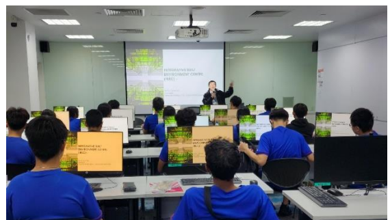
Sec 4 & 5 StaRs visiting Institutions of Higher Learning (IHLs)