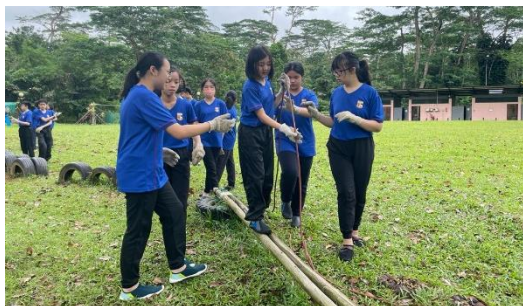
Sec 1 StaRs undergoing Low Elements

2. StaRs Programme. Our students have successfully completed the school's iconic cohort-level student development experience from 28 Feb to 3 Mar. Ranging from outdoor activities, Applied Learning Modules @ Schools, interview skills and learning journeys, the four-day programme has honed our students' social and emotional competencies and enabled them to grow holistically.