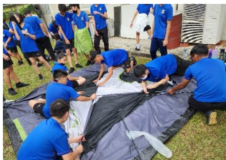
Sec 3 StaRs learning how to pitch a tent